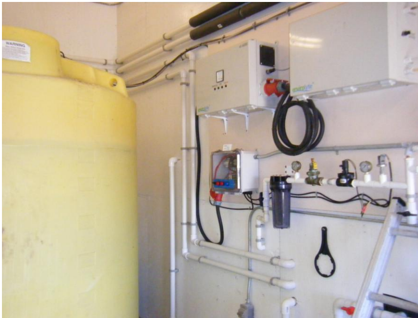
Envirolyte water treatment system. Canada

Hydrogen Peroxide is commonly used as a disinfectant in water systems. I found this most often used on organic dairy and beef farms. 35% food grade peroxide is diluted down to 3.5% and then added with some dosing meter to the livestock water system at 2-3%. This kills bacteria in the water and also helps keep water lines and bowls free of algae and other bio films. It is also supposed to have animal health benefits by adding oxygen to the stomach or blood of the animal, encouraging growth of beneficial bacteria. The additional health benefits are questionable, but the disinfection of the water and bowls is verifiable and can increase water consumption.