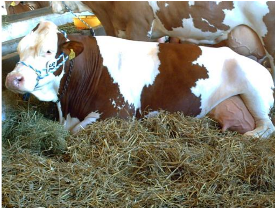
Purebred Fleckvieh cow: 10+ lactations, 100000+L milk, healthy. Germany

In the future I see the beef and dairy industries becoming one. There will be new found interest in dual purpose breeds like Fleckvieh and crossbreeding to add beef value to existing dairy herds. Milk and meat can come from the same herd with an improvement in genetics suitable to modern housing; it will also bring better health, and improved economics.