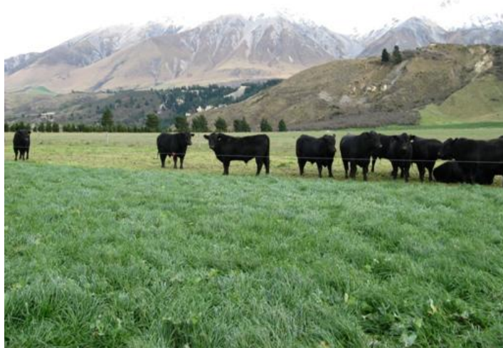
Intensive rotational grazing. New Zealand

that religiously believe grass or pasture based systems are the only way to raise livestock, especially cattle and sheep. Others believe you can supplement pasture and forage to the benefit of the animal and production. Still others, especially in North America believe that you can achieve better results with complete control and consistency, feeding complete total mixed rations.