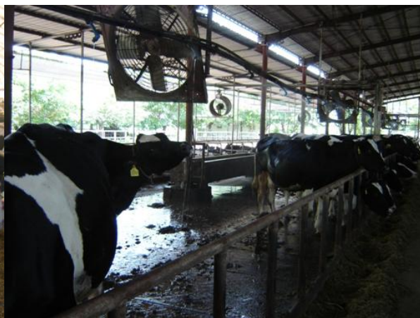
Shade, Fans and Misting. China

Adequate lighting is also important. Full daylight strength lighting can boost animal's immune system function, increase fertility, and result in higher production. Extended lighting is used to keep production up at peak levels in all seasons. It has been found with cattle that a period of darkness is also needed for proper hormone production, with six hours seeming to be the minimum.