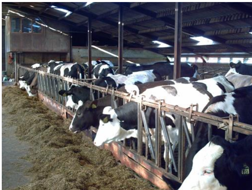
High forage total mixed ration feeding. Germany

What I have seen indicates that the middle ground is usually the best course. A variety of high quality forages, grains, pasture, and supplements is ideal, both for the farm and the animal. The dogma of grass is best does not hold up, when animal health can be improved by adding some protein and grain. Likewise, high grain and by-product feeding is not economical when livestock health and longevity are considered.