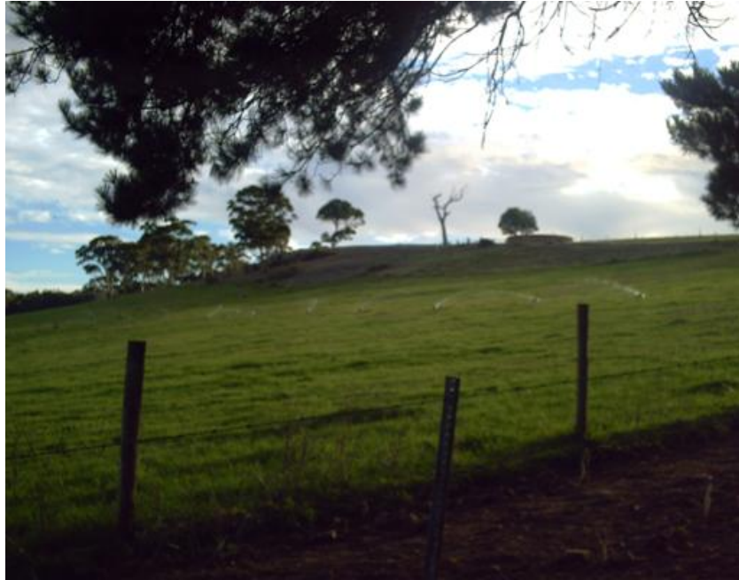
A biologically active, mineralized soil, growing nutrient dense grass. Australia